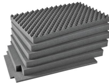
iM2950-FOAM 6 pc. Replacement Foam Set