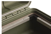
iM29XX-BEZEL Base Bezel Kit