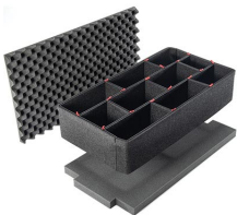
iM2950TPKIT TrekPak Case Divider Kit